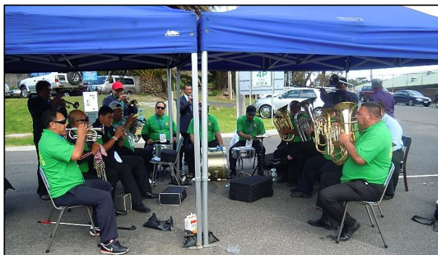
Images from past CICC assemblies

Komakoma mai ki te Tekeretere Maata me e au uianga tetai i mua ake ka aere mai ei ki te uipaanga, tena tona au numero i runga i te kapi mua o teia pepa. I te tuatau o te uipaanga maata, te vai ra te aronga angaanga te ka riro i te tauturu i tetai uatu me anoanoia. Ka riro katoa te au mema o te au oire ka noo kotou i te tauturu i tetai uatu me anoanoia. Ko tetai uatu au akakitekiteanga ka anoanoia, ka oronga iatu i te tuatau o te uipaanga.